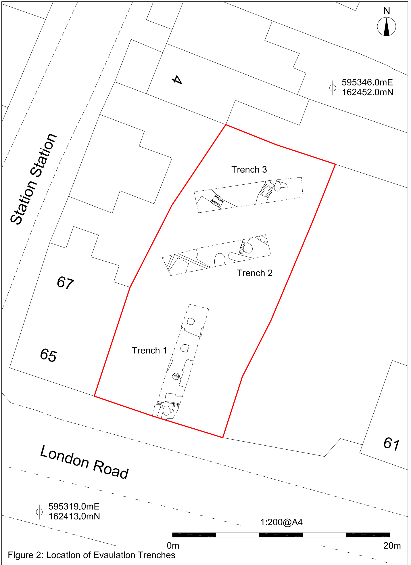
Figure 2: Location of Evaluation Trenches